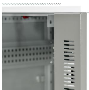
ventilation holes to improve equipment cooling

We have made every effort to ensure that the information presented is accurate and complete. However, we are not responsible for the accuracy and completeness of the data and, in particular, we cannot guarantee that this specification does not contain errors or mistakes. The information contained in this specification may be changed at any time without notice.