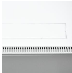
grommets in the bottom and in the roof